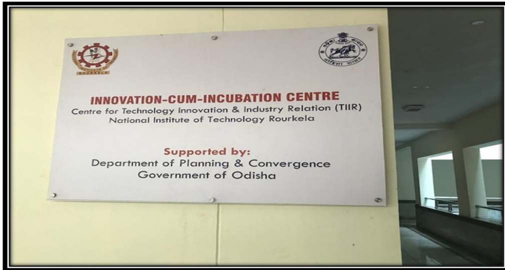
INNOVATION-CUM-INCUBATION CENTER AT NIT, ROURKELA

iv. VeerSurendra Sai University of Technology (VSSUT), Burla.