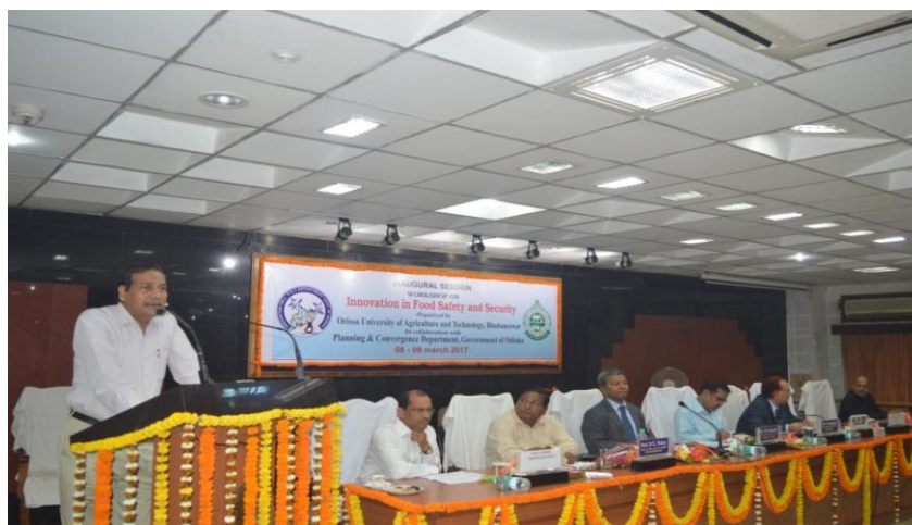
WORKSHOP ON INNOVATION FOR FOOD SAFETY & SECURITY